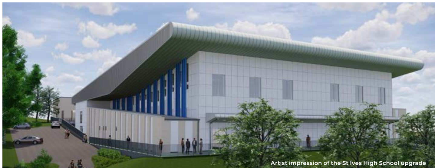
Artist impression of the St Ives High School upgrade