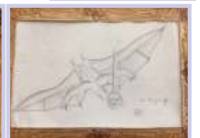
Four Highly Commended for creativity