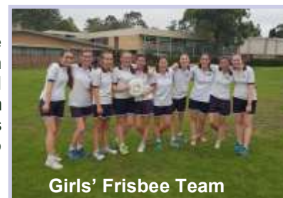
Girls' Frisbee Team

We were lucky enough to have five teams make it to the grand finals of the last grade sport season for 2018. The teams playing in the finals were the Boys Soccer 7's Open A, the Boys Soccer 7's Open B, the Girls Frisbee, the Mixed Netball A and the Netball U15's. A huge congratulations to the mixed netball A team, soccer 7's open A team and the soccer 7's open B team who were successful in their finals matches. Thanks to all of the students who played in a final and a big thank you to all of our staff who coached grade sports teams this season.