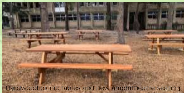
Hardwood picnic tables and new amphitheatre seating

Thank you to the amazing team of parents and students who worked hard on the day (and into the evening) to make this happen!