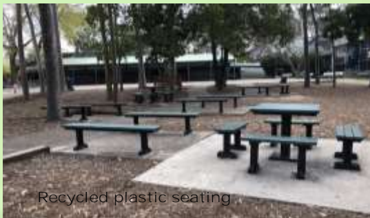
Recycled plastic seating

Here's a snapshot of what the PandC recently funded with the assistance of your voluntary contributions.