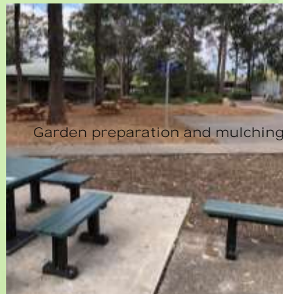
Garden preparation and mulching